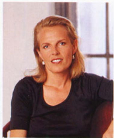
Tel.: 212-219-9571 www.selldorf.com